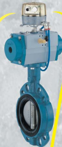
Combi switchbox for pneumatic quarter turn actuators