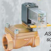
AS-i socket and solenoid valve for general applications