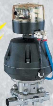
Combi switchbox for diaphragm and angle seat globe valves