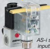
AS-i socket with inputs and pilot valve