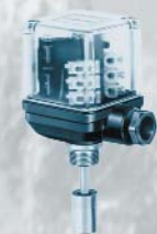
Electrical position indicator