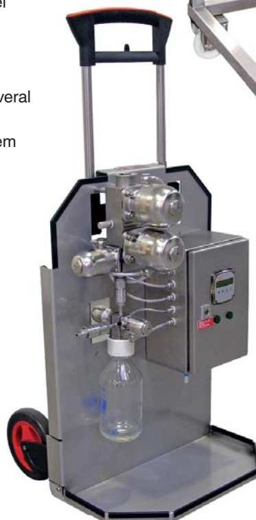
Compact, light sampling unit