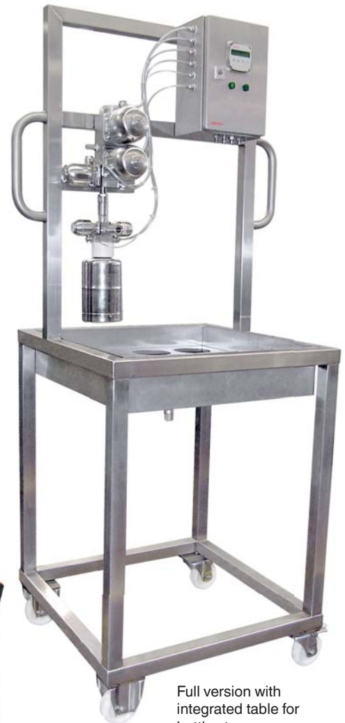
Full version with integrated table for bottle storage